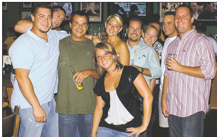
The gang's all here. Friends enjoy a night out at Duffy's Sports Grill.

Smoking: Covered smoking dining and waiting area outside